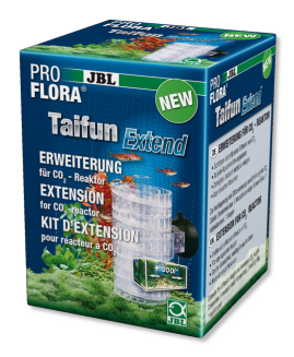
JBL PROFLORA Taifun Extend Extension for CO2 highperformance diffuser