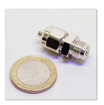
JBL tube screw connection 4/6 pressure reducer