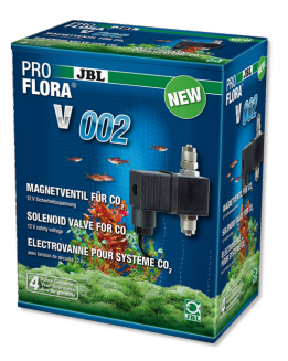
JBL PROFLORA v002 Noiseless solenoid valve