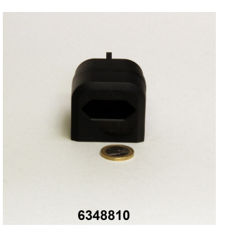
JBL adapter UK for all flat-pin plugs