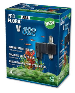
JBL PROFLORA v002

Fitting to reduce pressure for 2 CO2 diffusers