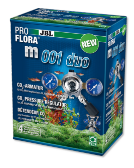
JBL PROFLORA m001 duo Fitting to reduce pressure for 2 CO2 diffusers