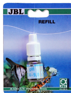
JBL pH Test 7.4-9.0 pH test in aquariums and ponds in the range 7.4-9.0