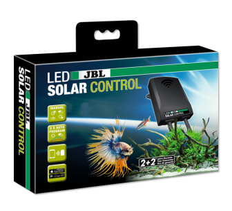
JBL LED SOLAR CONTROL Control unit for JBL LED SOLAR lights