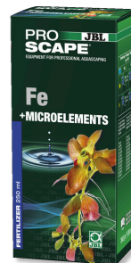
JBL PROSCAPE Fe + MICROELEMENTS Basic plant fertiliser for aquascaping