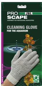
JBL PROSCAPE CLEANING GLOVE Aquarium cleaning glove