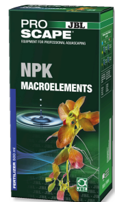
JBL PROSCAPE NPK MACROELEMENTS 3-component plant fertiliser for aquascaping