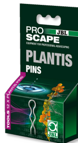
JBL PROSCAPE PLANTIS PINS Plant pegs for the anchoring of aquarium plants