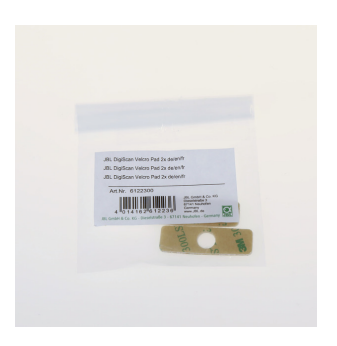
JBL DigiScan Velcro Pad, 2x