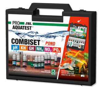
JBL PROAQUATEST COMBISET POND

Test case with 13 water tests for freshwater analysis