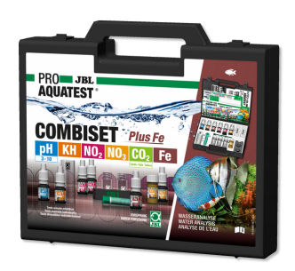
JBL PROAQUATEST COMBISET Plus Fe

Test case with most important water tests + iron test