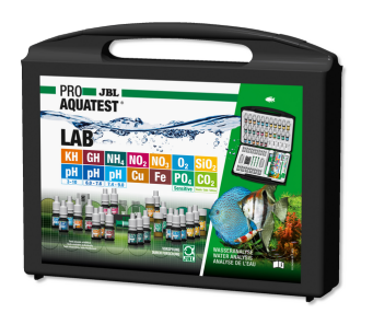
JBL PROAQUATEST LAB

Test case with most important water tests + NH4 test