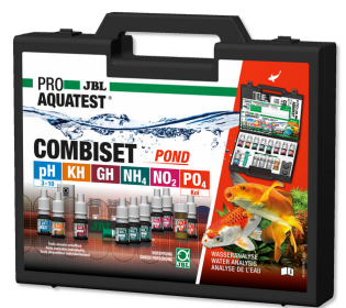
JBL PROAQUATEST COMBISET POND

Test case with 13 water tests for freshwater analysis