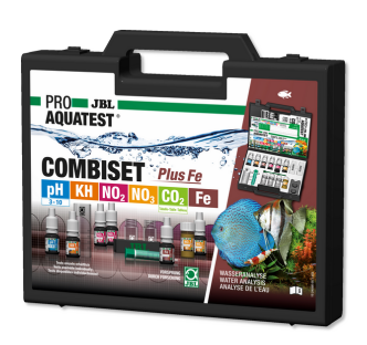
JBL PROAQUATEST COMBISET Plus Fe

Test case with most important water tests + iron test