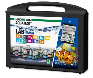
JBL PROAQUATEST LAB Marin

Test case for water analysis in plant aquariums