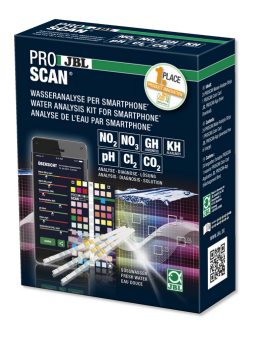
JBL PROSCAN Water test with analysis via smartphone