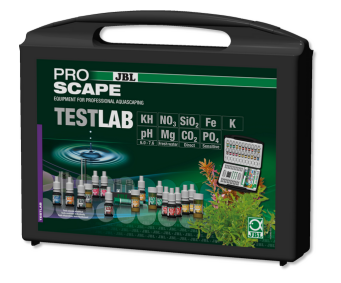
JBL PROAQUATEST LAB PROSCAPE

Test case for water analysis in plant aquariums