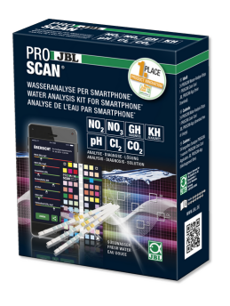
JBL PROSCAN Water test with analysis via smartphone