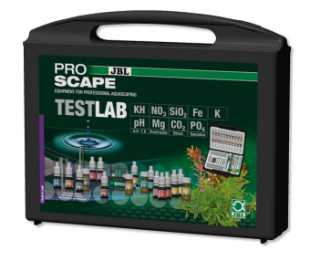
JBL PROAQUATEST LAB PROSCAPE

Test case for water analysis in plant aquariums