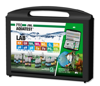
JBL PROAQUATEST LAB Test case with 13 water tests for freshwater analysis