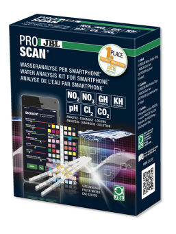
JBL PROSCAN Water test with analysis via smartphone