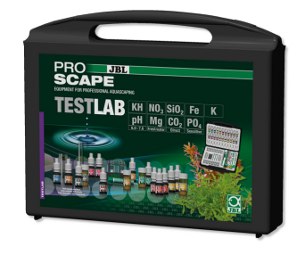
JBL PROAQUATEST LAB PROSCAPE

Test case for water analysis in plant aquariums