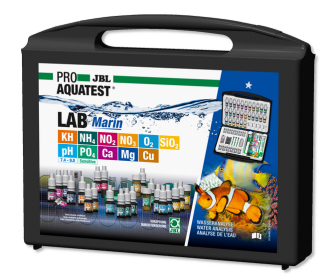
JBL PROAQUATEST LAB Marin

Test case for water analysis in plant aquariums