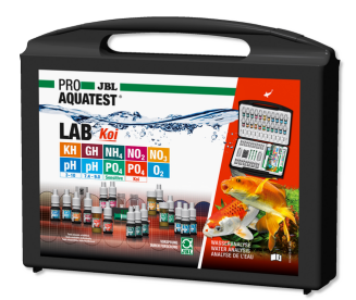
JBL PROAQUATEST LAB Κ̀οί

Professional test case for koi and garden ponds