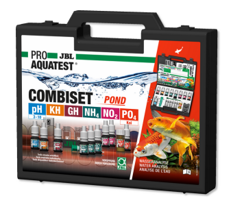
JBL PROAQUATEST COMBISET POND Test case for water analyses in