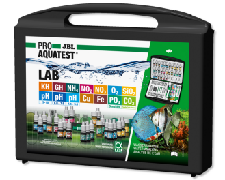
JBL PROAQUATEST LAB Test case with 13 water tests for freshwater analysis