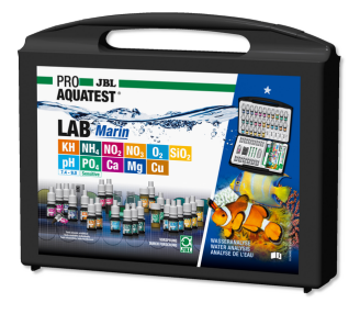
JBL PROAQUATEST LAB Marin

Professional test case for marine water analysis