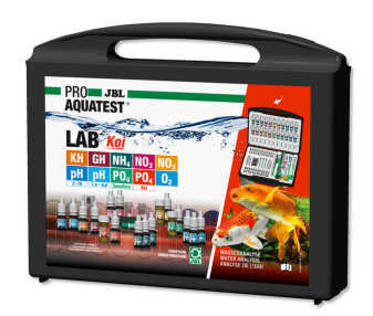
JBL PROAQUATEST LAB Κοί

Professional test case for marine water analysis