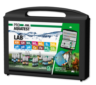
JBL PROAQUATEST LAB Test case with 13 water tests

Test case with most important water tests + iron test