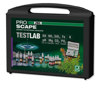
JBL PROAQUATEST LAB PROSCAPE

Test case for water analysis in plant aquariums