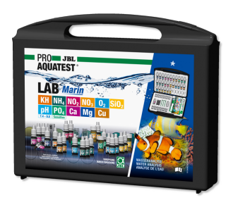
JBL PROAQUATEST LAB Marin

Test case for water analysis in plant aquariums