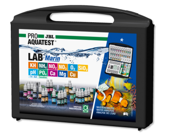
JBL PROAQUATEST LAB Marin

Professional test case for marine water analysis