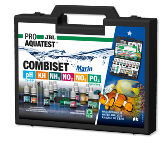
JBL PROAQUATEST COMBISET Marin

Professional test case for marine water analysis