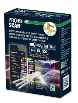
JBL PROSCAN Water test with analysis via smartphone