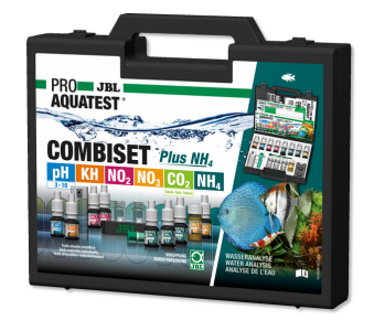
JBL PROAQUATEST COMBISET Plus NH4 Test case with most important water tests + NH4 test