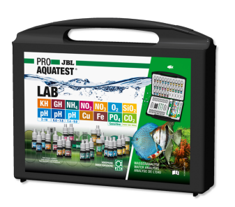
JBL PROAQUATEST LAB Test case with 13 water tests