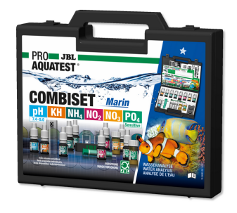
JBL PROAQUATEST COMBISET Marin

Professional test case for marine water analysis