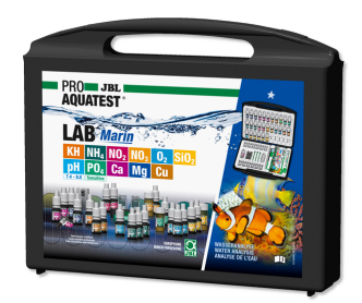
JBL PROAQUATEST LAB Marin

Professional test case for marine water analysis