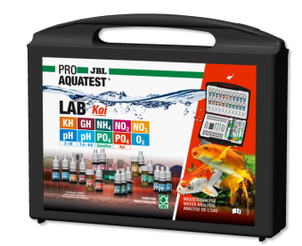
JBL PROAQUATEST LAB Řoi

Test case for water analyses in marine aquariums