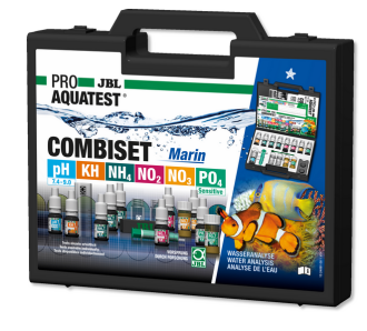
JBL PROAQUATEST COMBISET Marin Test case for water analyses in marine aquariums