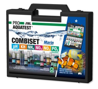
JBL PROAQUATEST COMBISET Marin

Professional test case for marine water analysis