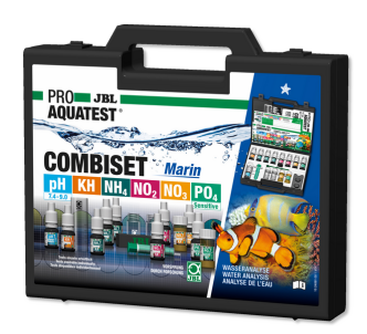
JBL PROAQUATEST COMBISET Marin

Professional test case for marine water analysis