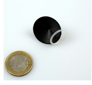
Spare part kit for JBL CO2 Permanent Suction cup & seal ring for the CO2 permanent test