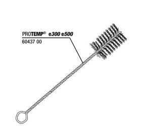
JBL ProTemp e300/500 cleaning brush