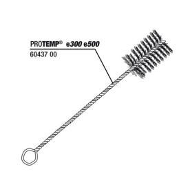
JBL ProTemp e300/500 cleaning brush