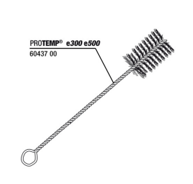
JBL ProTemp e300/500 cleaning brush