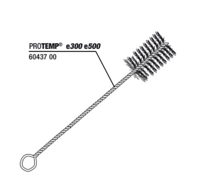
JBL ProTemp e300/500 cleaning brush