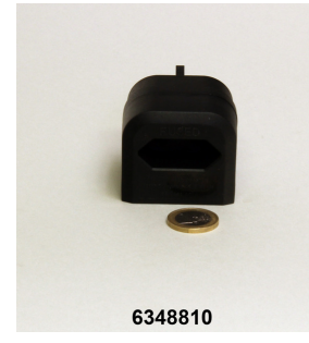
JBL adapter UK for all flat-pin plugs