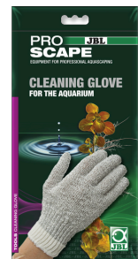
JBL PROSCAPE CLEANING GLOVE Aquarium cleaning glove