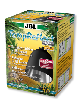
JBL TempReflect light Reflector screen for energysaving lamps