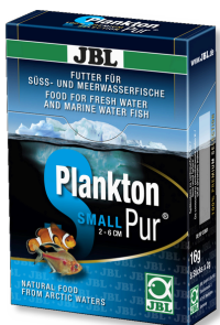
JBL PlanktonPur SMALL