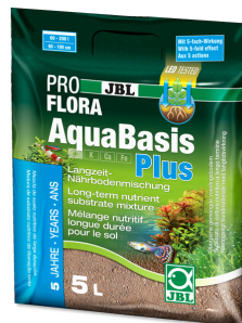
JBL PROFLORA AquaBasis plus

Plant fertiliser for freshwater aquariums