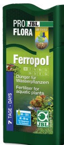
JBL PROFLORA Ferropol

Plant fertiliser for freshwater aquariums