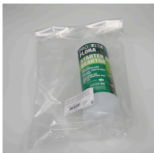
JBL PF CO2 STARTER BIO REAKTOR