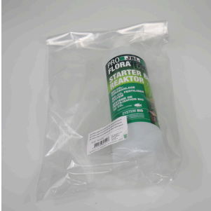
JBL PF CO2 STARTER BIO REAKTOR