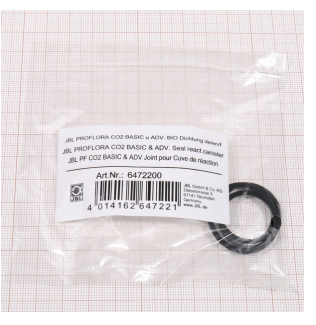
JBL PF CO2 BIO REAKTOR seal