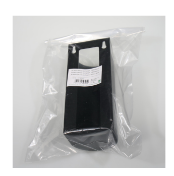
JBL PF CO2 BIO THERMAL CASING