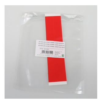
JBL PF CO2 BIO THERMAL CASING adhesive tape

Glass CO2 diffuser for freshwater tanks from 40-300 I