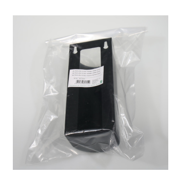
JBL PF CO2 BIO THERMAL CASING