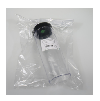
JBL PF CO2 BIO REAKTOR