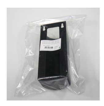
JBL PF CO2 BIO THERMAL CASING