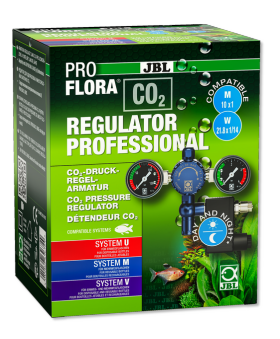
JBL PROFLORA CO2 REGULATOR PROFESSIONAL

Glass CO2 diffuser for freshwater tanks from 40-300 l