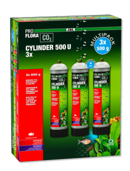
JBL PROFLORA CO2 CYLINDER 500 U 3x

Expandable CO2 reactor for freshwater aquariums