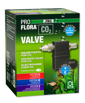
JBL PROFLORA CO2 VALVE

Refillable storage cylinder, ready-filled with 2kg CO2