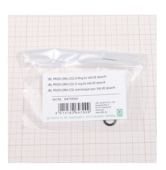
JBL PF CO2 O-ring for VALVE