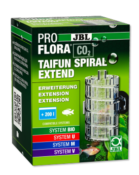
JBL PROFLORA CO2 TAIFUN SPIRAL EXTEND

CO2 bubble counter with builtin check valve