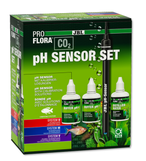
JBL PROFLORA CO2 pH SENSOR SET

pH electrode, labor. quality for almost all pH devices