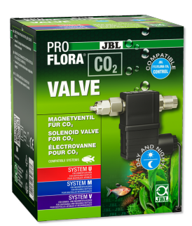
JBL PROFLORA CO2 VALVE

Disposable storage bottle ready-filled with 1.2 kg CO2