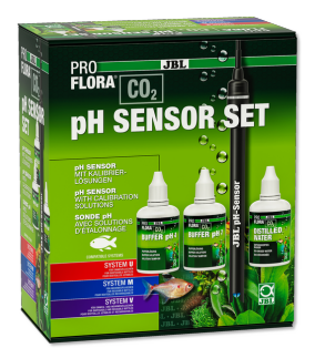
JBL PROFLORA CO2 pH SENSOR SET

pH electrode, labor. quality for almost all pH devices