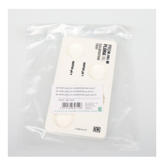
JBL PF CO2 CALIBRATION tray To keep the cuvettes upright during calibration