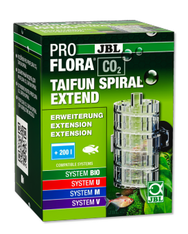
JBL PROFLORA CO2 TAIFUN SPIRAL EXTEND

Expandable CO2 reactor for freshwater aquariums