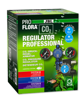
JBL PROFLORA CO2 REGULATOR PROFESSIONAL

Glass CO2 diffuser for freshwater tanks from 40-300 l