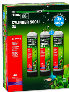
JBL PROFLORA CO2 CYLINDER 500 U 3x 500g disposable CO2 storage cylinder (value pack of 3)