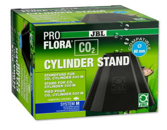
JBL PROFLORA CO2 CYLINDER STAND

Wall mount for CO2 cylinders with safety bracket