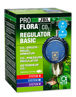
JBL PROFLORA CO2 REGULATOR BASIC

Glass CO2 diffuser for freshwater tanks from 40-300 l