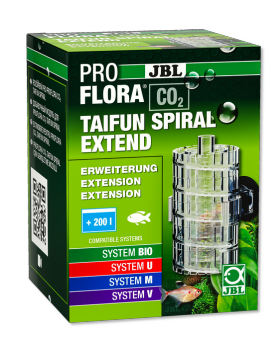
JBL PROFLORA CO2 TAIFUN SPIRAL EXTEND

Expandable CO2 reactor for freshwater aquariums