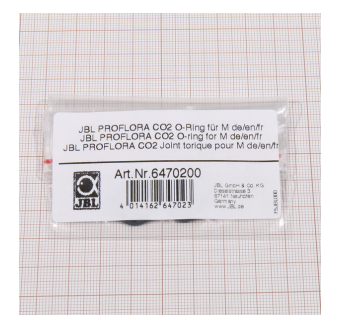
JBL PROFLORA CO2 Oring for m