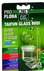
JBL PROFLORA CO2 TAIFUN GLASS Glass CO2 diffuser for freshwater tanks from 40-300 l