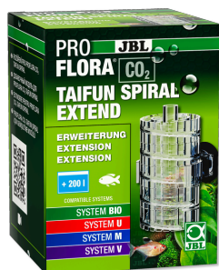
JBL PROFLORA CO2 TAIFUN SPIRAL EXTEND Extension for JBL PROFLORA CO2 TAIFUN SPIRAL 5 / 10