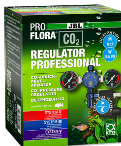
JBL PROFLORA CO2 REGULATOR PROFESSIONAL Pressure regulator with 2 displays & valve for CO2