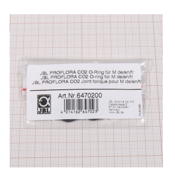
JBL PROFLORA CO2 Oring for m