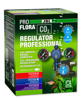
JBL PROFLORA CO2 REGULATOR PROFESSIONAL

Pressure regulator with 2 displays & valve for CO2