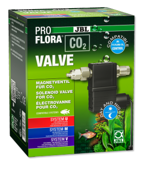
JBL PROFLORA CO2 VALVE

CO2 solenoid valve for regulated CO2 addition