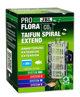
JBL PROFLORA CO2 TAIFUN SPIRAL EXTEND Extension for JBL PROFLORA CO2 TAIFUN SPIRAL 5 / 10