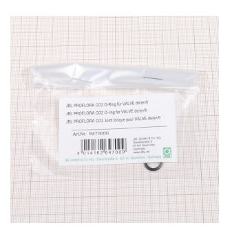
JBL PF CO2 O-ring for VALVE