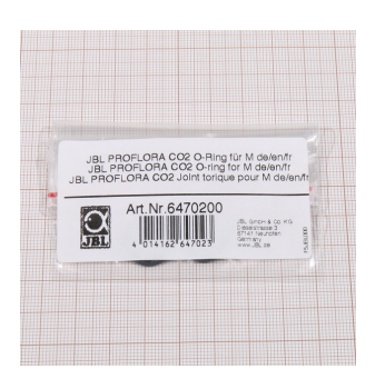
JBL PROFLORA CO2 Oring for m